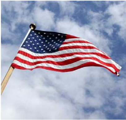
"Made in America", Faded Glory?